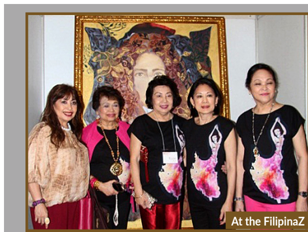
At the FilipinaZ