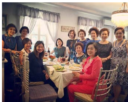
▲ Early birds sat together over a nice bottle of Bordeaux wine