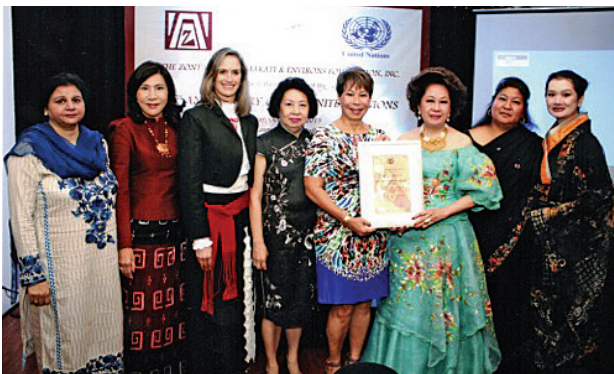
A Certificate of Appreciation was awarded to SHOM for their generous donation of P416, 000 to the ZCME Duyan Psychological Center at Marillac Hills.