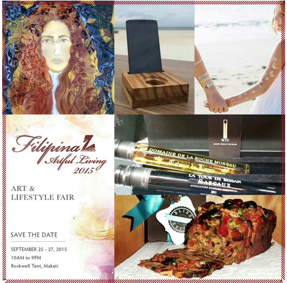
FilipinaZ 2015 poster and invitation