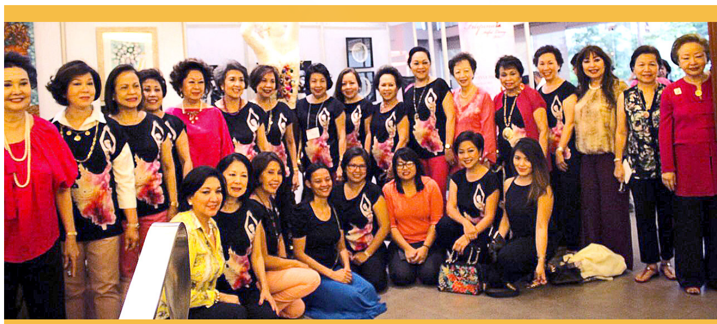
ZCME members gather together at their 2015 FilipinaZ Artful Fair