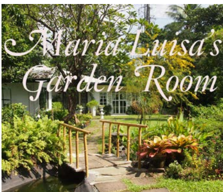
What a delightful way to celebrate our Club's 45th Sapphire anniversary by having lunch at the Makati Garden Club's little French resto - Maria Luisa's Garden Room on April 26, 2016.