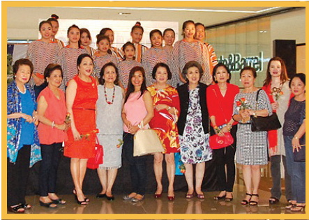
Zontians and some guests are shown with Marillac girls at the Crate & Barrel shop in SM Aura following the girls' performance.