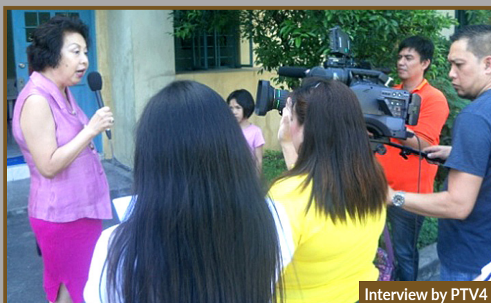
Interview by PTV4