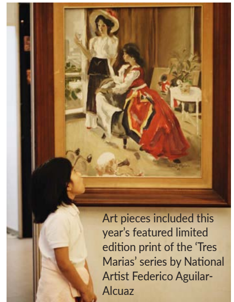
Art pieces included this year's featured limited edition print of the 'Tres Marias' series by National Artist Federico Aguilar-Alcuaz

FilipinaZ Art and Lifestyle Fair is the only bazaar that is created by women specifically for women. Spearheaded by the Zonta Club of Makati and Environs, the proceeds from the fair will be used to further the many women-empowering projects of the club. Among ZCME's programs are: Psychological Center for Sexually Abused Children, Empowering Women Scholarship Program, NO to Early Marriage and Teenage Pregnancy advocacy, as well as projects promoting women's health and livelihood.